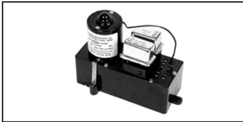
Baader-Brown 6404-1125 & 6404-1920